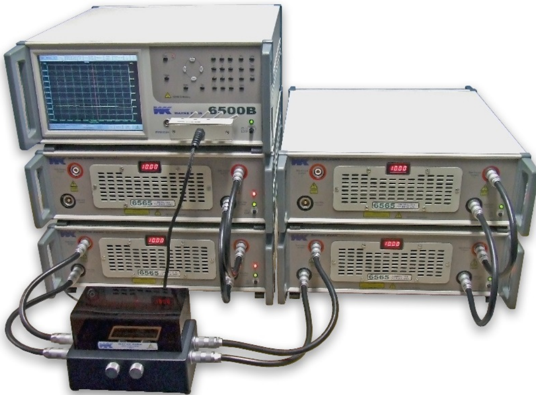
Typical 120 MHz 40 A DC Bias Current System (using 65120B, 4 x 6565-120 and 1027 Fixture)