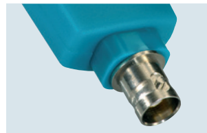
testo 206-pH3: pH3 probe head with BNC interface