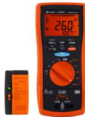
Figure 4. U1117A IR-to-Bluetooth Adapter enables wireless remote testings with the U1450A/U1460A series