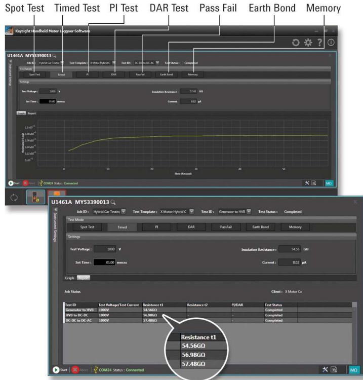
Job Status Reporting View

Eliminate the conventional data entering process and get error-free automated test reports generated in a tabulated or graphical form for easy interpretation and analysis – essential for troubleshooting, commissioning and preventive maintenance tasks. Better yet: All five insulation testers are compatible with the U1117A IR-to-Bluetooth ® adapter to enable wireless remote testing using Windows PC 1 or on iOS/Android smart devices. 2