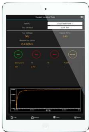
Figure 2. Perform remote testing with Keysight Insulation Tester Application