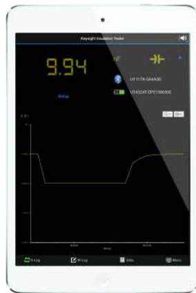
Figure 3. Data logging interface on Keysight Insulation Tester Application