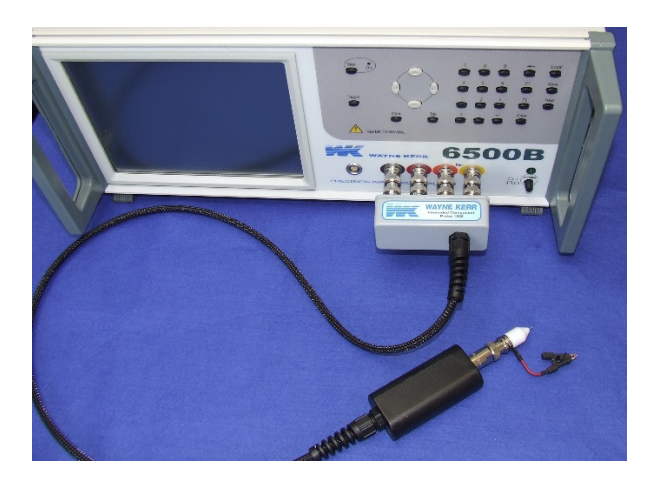
1J1025 Probe ready for use